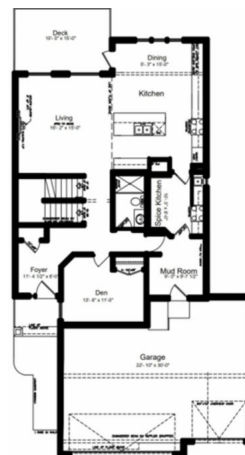
Main Floor Plan