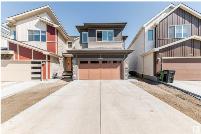
2023 157 St SW, Edmonton, AB

Main Floor Exterior Area 1046.51 sq ft Interior Area 973.00 sq ft Excluded Area 428.21 sq ft