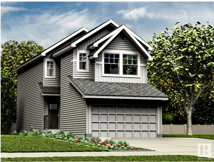
The Archer 20 | 1,585 Sq. Ft.