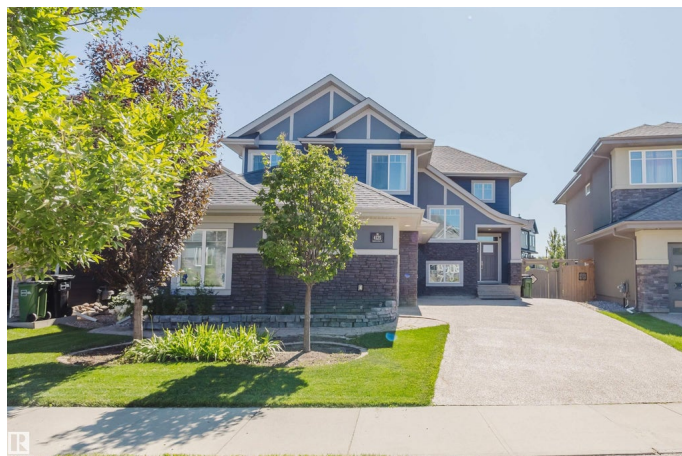
4125 Kennedy Green SW, Edmonton, AB

Main Floor Exterior Area 1236.94 sq ft Interior Area 1158.39 sq ft Excluded Area 737.06 sq ft