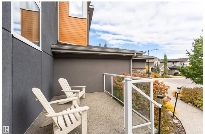
7404 May Common NW, Edmonton, AB